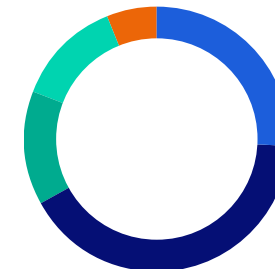
HEADCOUNT BY SEGMENT FOR EMPLOYEES (%)